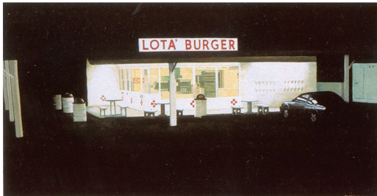
"Lota' Burger"